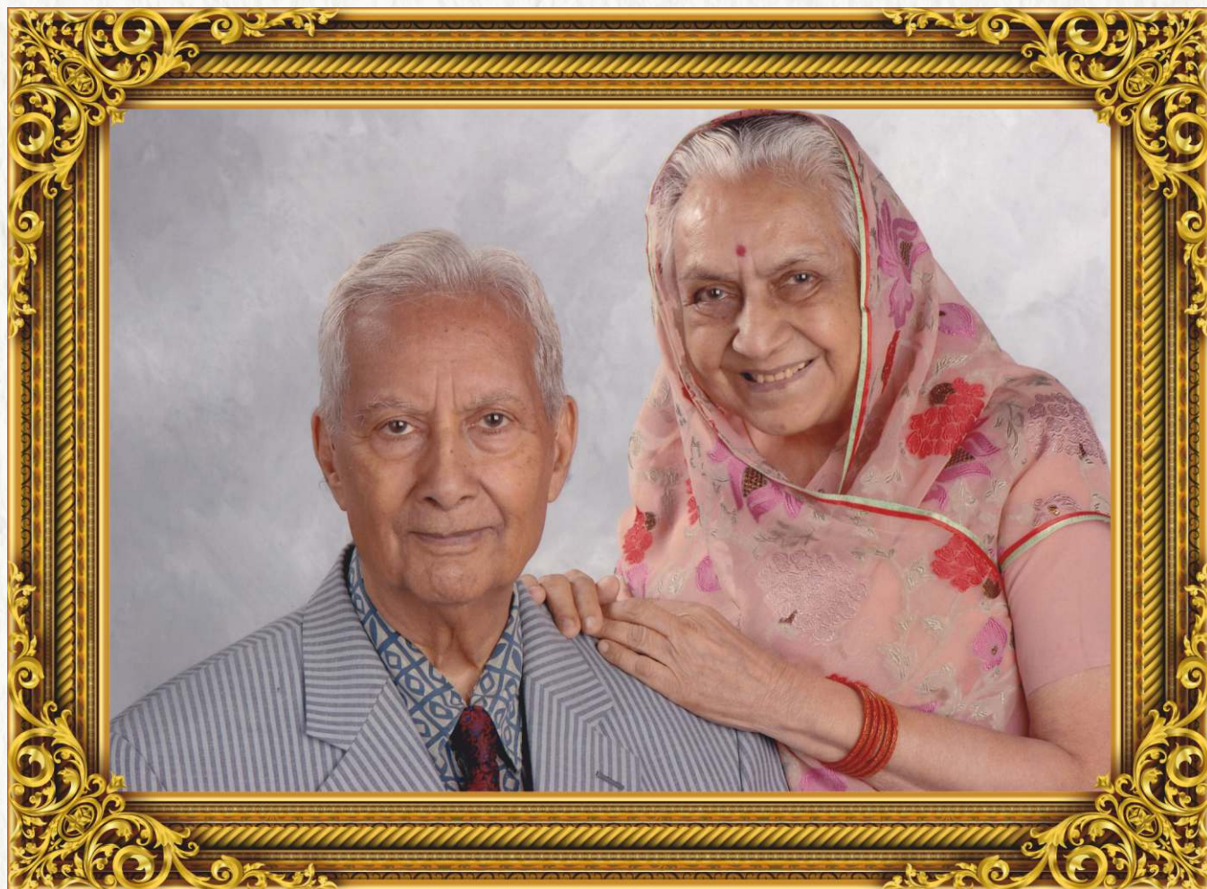
HEAVENLY SYT. BASANT KUMAR BIRLA & HEAVENLY SMT. SARALA BIRLA

"My objective of life is not solely the pursuit of industry, business and trade; for a rich and full life, interest and involvement in Fine Arts, Music, Literature, Social, Cultural and Spiritual activities are essential."